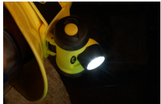
The HT-400Z0 allows hands free illumination