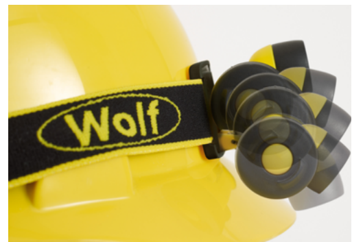
A tilt mechanism allows the beam to be directed where needed