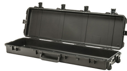
iM3300-X0000 No Foam