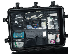
iM3075-UTILITYORG Utility Organizer