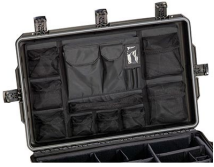
iM29XX-UTILITYORG Utility Organizer