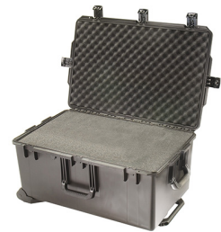
iM2975-X0001 With Foam