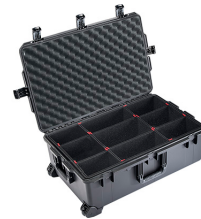
iM2950-X0006 With TrekPak Divider System