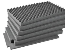
iM2950-FOAM 6 pc. Replacement Foam Set