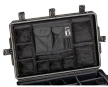
iM29XX-UTILITYORG Utility Organizer