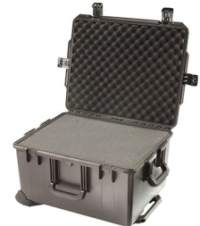
iM2750-X0001 With Foam