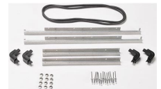
iM27XX-M4-BEZEL-L Lid Bezel (Metric)