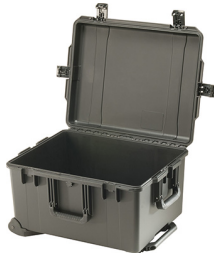
iM2750-X0000 No Foam