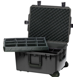
iM2750-X0002 With Padded Dividers