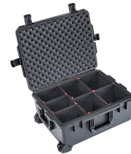
iM2720-X0006 With TrekPak Divider System