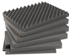
iM2720-FOAM 5 pc. Replacement Foam Set