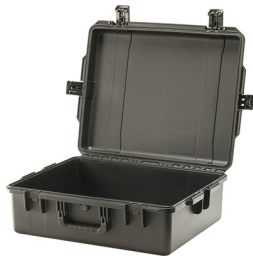
iM2700-X0000 No Foam