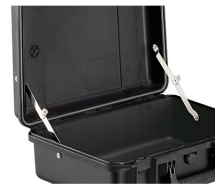
iM-LIDSTAY Lid Stay