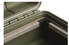
iM27XX-M4-BEZEL Base Bezel (Metric)