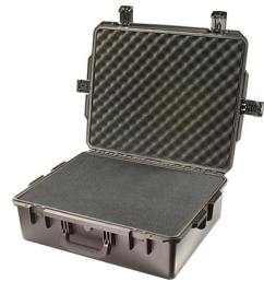
iM2700-X0001 With Foam