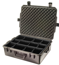
iM2700-X0002 With Padded Dividers