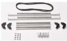
iM27XX-M4-BEZEL-L Lid Bezel (Metric)