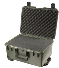
iM2620-X0001 With Foam