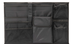
iM26XX-UTILITYORG Utility Organizer