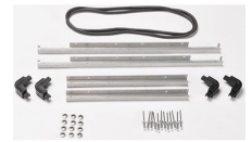
iM2600-M4-BEZEL-L Lid Bezel (Metric)