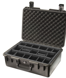
iM2600-X0002 With Padded Dividers