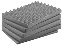
iM2600-FOAM 5 pc. Replacement Foam Set