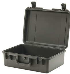
iM2600-X0000 No Foam