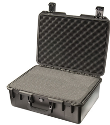
iM2600-X0001 With Foam