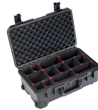
iM2500-X0006 With TrekPak Divider System