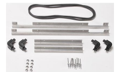
iM2500-M4-BEZEL-L Lid Bezel (Metric)