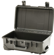
iM2500-X0000 No Foam