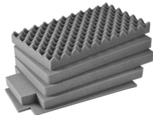
iM2500-FOAM 5 pc. Replacement Foam Set