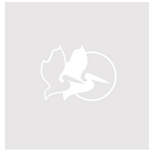
iM2500-X0002 With Padded Dividers