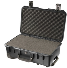
iM2500-X0001 With Foam