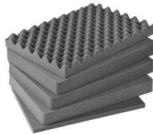
iM2450-FOAM 5 pc. Replacement Foam Set