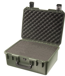
iM2450-X0001 With Foam