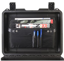
iM24XX-LIDORG Lid Organizer