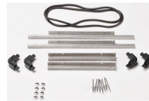
iM2306-M4-BEZEL-L Lid Bezel (Metric)