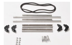
iM2300-M4-BEZEL-L Lid Bezel (Metric)