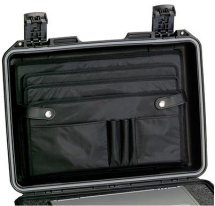
iM2300-LIDORG Lid Organizer