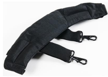
iM-STRAP-S-VER2 Padded Shoulder Strap