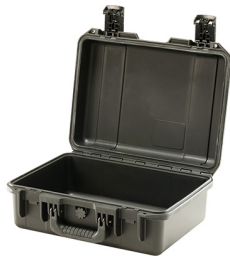
iM2200-X0000 No Foam