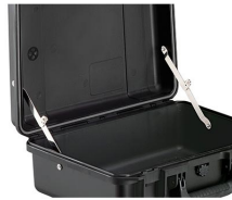
iM-LIDSTAY Lid Stay