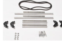
iM2200-M4-BEZEL-L Lid Bezel (Metric)