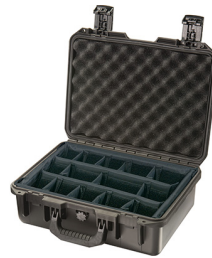
iM2200-X0002 With Padded Dividers