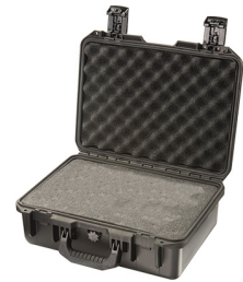
iM2200-X0001 With Foam