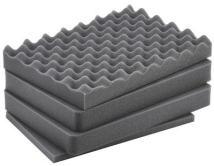
iM2200-FOAM 4 pc. Replacement Foam Set