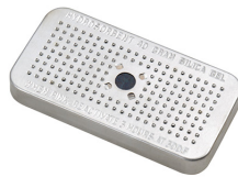
1500D Desiccant Silica Gel