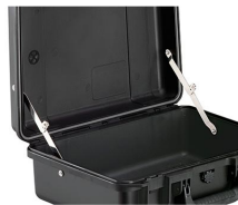
iM-LIDSTAY Lid Stay