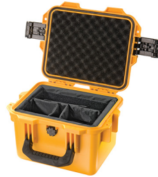
iM2075-X0002 With Padded Dividers