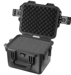
iM2075-X0001 With Foam