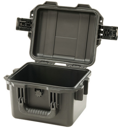
iM2075-X0000 No Foam