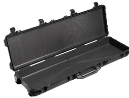
1750NF No Foam