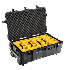
1674 With Padded Dividers