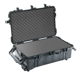
1670WF With Foam