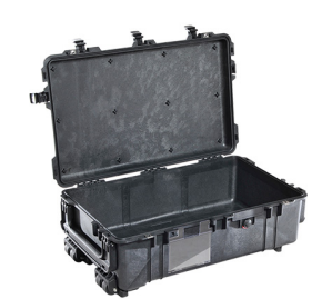
1670NF No Foam