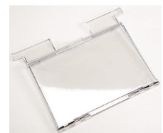
1630DC Document Container Accessory