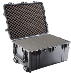
1630WF With Foam