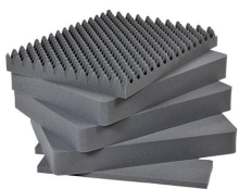
1631 5 pc. Replacement Foam Set