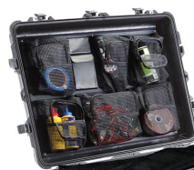
1639 Lid Organizer