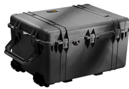
1630NF No Foam