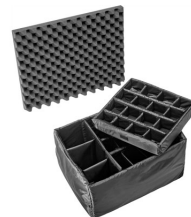
1625 Padded Divider Set