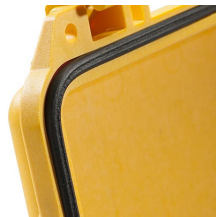
1623 Replacement O-ring