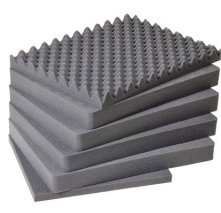
1621 6 pc. Replacement Foam Set