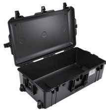
1615NF No Foam