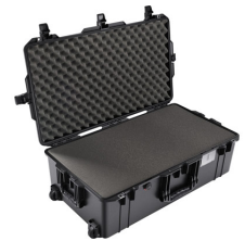
1615WF With Foam