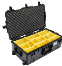
1615WD With Padded Dividers