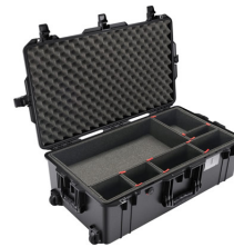
1615TP With TrekPak Divider System