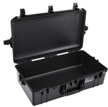
1605NF No Foam