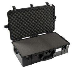
1605WF With Foam