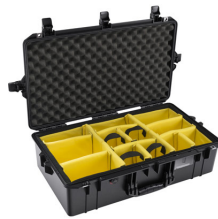
1605WD With Padded Dividers