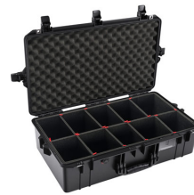
1605TP With TrekPak Divider System