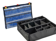
1605EMS EMS Accessory Set (Lid Organizer and Divider Set)