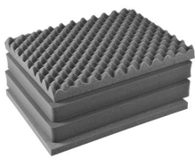
1601 4 pc. Replacement Foam Set