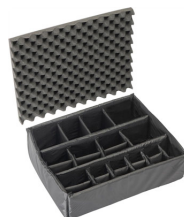
1605 Padded Divider Set