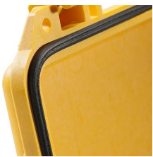
0343 Replacement O-ring