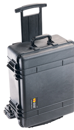
1560MNF No Foam