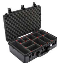
1555TP With TrekPak Divider System