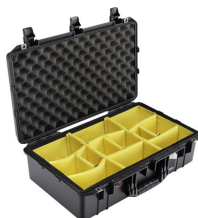
1555WD With Padded Dividers