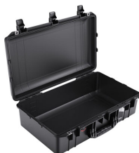
1555NF No Foam