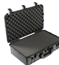
1555WF With Foam