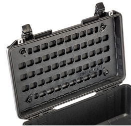
1535MP EZ-Click™ MOLLE Panel