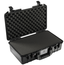
1525WF With Foam