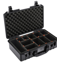
1525TP With TrekPak Divider System