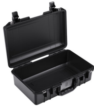
1485NF No Foam