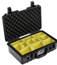
1485WD With Padded Dividers