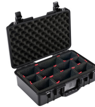
1485TP With TrekPak Divider System