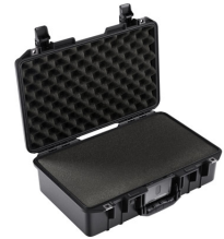
1485WF With Foam