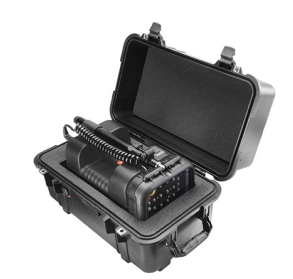
1460AALG With Custom Foam for 9430 / 9435