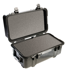
1460WF With Foam