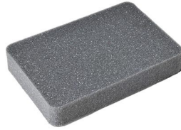
1052 Pick N Pluck™ Foam Insert